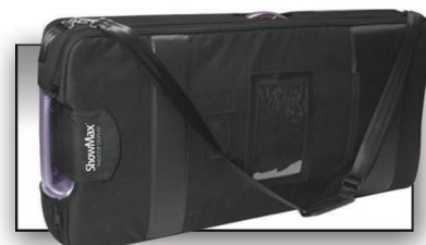
Optional travel bag is available for the ShowMax.